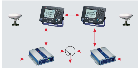
Redundant DGPS System