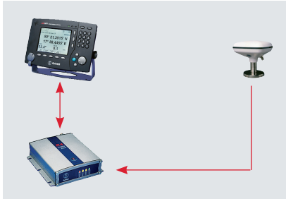
Stand-alone GPS or DGPS System