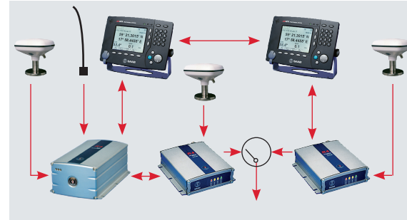
Combined AIS/Redundant DGPS System