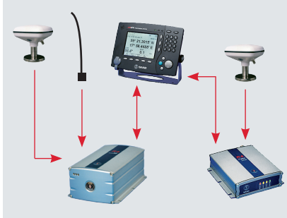
Combined AIS/DGPS System