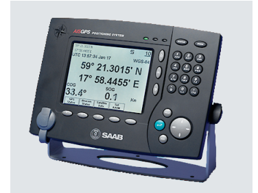
R4 Control and Display Unit